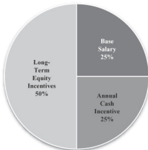
Chief Executive Officer 2012 Pay Mix